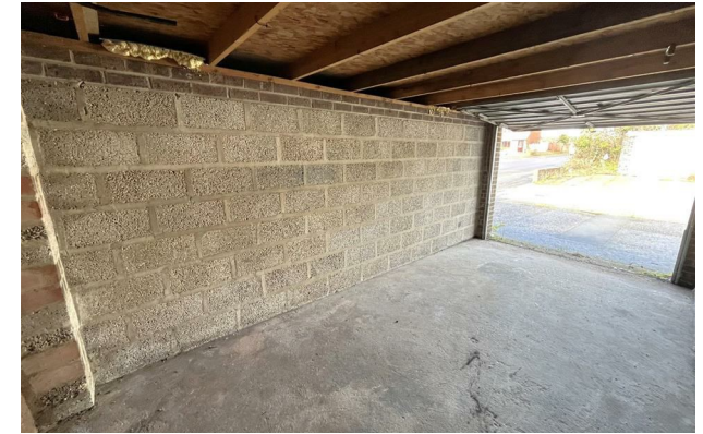
GARAGE 140 sq.ft. (13.0 sq.m.) approx.